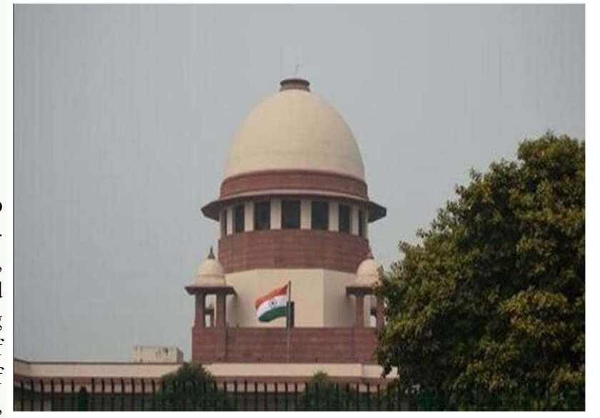
of cultures': SC

The top court also noted that before scrapping the UP Madarsa Act, it is important to see through the broad sweep of the country, and the judiciary must preserve the nation's culture. "Ultimately, we have to see it through the broad sweep of the country. Religious instructions are there not just for Muslims. It is there for Hindus, Sikhs, Christians, etc. The country ought to be a melting pot of cultures, civilisations, and religions. Let us preserve it that way. In fact, the answer to ghettoisation is to allow people to come to the mainstream and to allow them to come together. Otherwise, what we essentially would be doing is to keep them in silos," PTI quoted the CJI's remark.