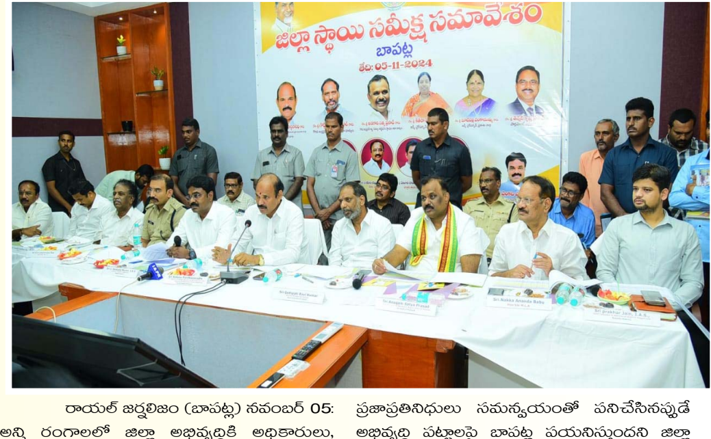
రాయల్ జర్నలిజం (బాపట్ల) నవంబర్ 05: ప్రజాప్రతినిధులు సమన్వయంతో పనిచేసినప్పుడే అన్ని రంగాలలో జిల్లా అభివృద్ధికి అధికారులు, అభివృద్ధి పట్టాలపై బాపట్ల పయనిస్తుందని జిల్లా

అన్ని రంగాలలో జిల్లా అభివృద్ధికి అధికారులు, అభివృద్ధి పట్టాలపై బాపట్ల పయనిస్తుందని జిల్లా అభివృద్ధి దిశగా పయనిస్తుందన్నారు. బాపట్ల జిల్లాకు 95 కిలోమీటర్ల తీర ప్రాంతం ఉందని, పర్యాటకంగా వివిధ ప్రాజెక్టులతో అభివృద్ధి చేయగలిగితే అన్ని రంగాలలో రాజీంచ గలవన్నారు. గోవాలో ఏమీ లేకపోయినప్పటికీ పర్యాటక ప్రాంతంగా ప్రాచుర్యం పొందిన విషయాన్ని ఆయన గుర్తు చేస్తూ, సూర్యలంక బీచ్ పర్యాటక కేంద్రంగా మారనుందన్నారు. బీచ్ అభివృద్ధికి సమగ్ర ప్రణాళిక రూపొందించి నివేదికను తక్షణమే అమలులోకి తెచ్చామన్నారు. ముఖ్యంగా సర్వీస్ సెక్టార్ లోనే యువతకు అత్యధికంగా ఉద్యోగ అవకాశాలు వస్తాయన్నారు. జల వనరులు అందుబాటులో ఉన్న బాపట్లలో పరిశ్రమల స్థాపనకు ప్రభుత్వ నూతన విధానాలు తోడైతే పారిశ్రామిక రంగం అభివృద్ధి జరుగుతుందన్నారు. బాపట్ల జిల్లాలోని ఆయా శాఖలలో ఖాళీగా ఉన్న ఉద్యోగాల భర్తీకి కృషి చేస్తామన్నారు. జిల్లా అభివృద్ధికి నా వంతు కృషి చేస్తామన్నారు.